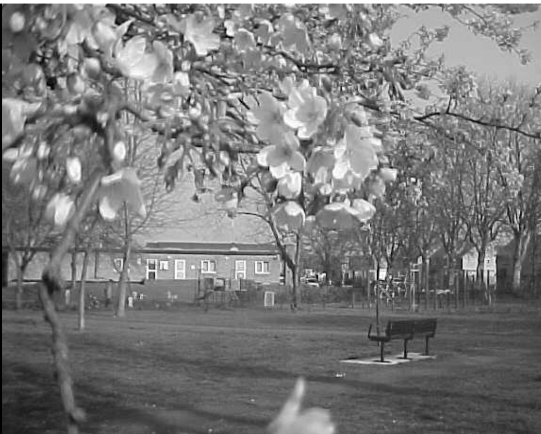
View of St. Matthew's Piece and the south side of the former Howard Mallett Centre, showing new play equipment and one of the new benches. The entrance to the Community Room is the left-most of the three doors on the building.

The next stage to these improvements will be the erection of a Community Noticeboard, which will be installed later this year; new fencing on the York Street side; and resurfacing of the pathways. So go on ... come and enjoy this much improved facility with your families.