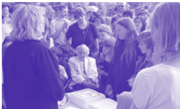
Cutting the Golden Jubilee cakes at last year's Summer Event -it was a huge success with maypole dancing and many people booking pitches.

For the last 5 years, PACT has been campaigning actively on behalf of local residents on issues that PACT members raise. We welcome any newcomers to the area, and hope this 5th annual issue of ImPACT will be of interest to all local residents.