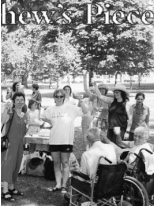
PACT members at a Summer Picnic on St Matthew's Piece

St Matthew's Piece is the 103-year-old park bounded by Abbey Walk, Sturton Street, York Street and New Street. Funds have become available for improvements to the facilities and layout of this park. The City Council has drawn up some ideas for this. Initially PACT and the immediate neighbours of the park were consulted on these plans. This feedback will fuel the next round of consultation by the City Council's Parks and Recreation Department. They are particularly keen to gain the opinion of a wider number of users of the park and those who live close to it. Be on the lookout for your chance to contribute to this process.