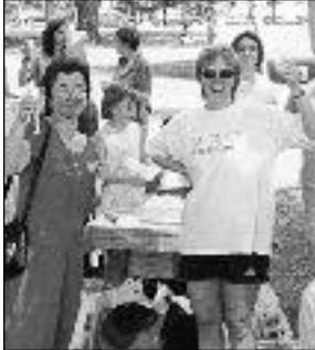
PACT members and friends at the Summer Party 1999

Newsletter for PACT (Petersfield Area Community Trust) Summer 2000 • Issue 2