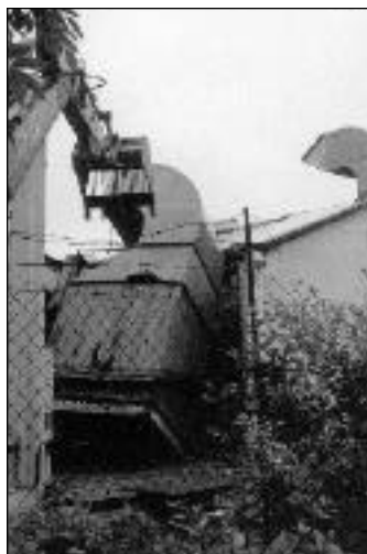
Demolition at Philips site. Taken from Silverwood Close, this picture shows the close proximity to neighbouring streets.

There are many other planning issues and not enough room here. For more information or to join the working party contact Glenys Malyon on 570157.